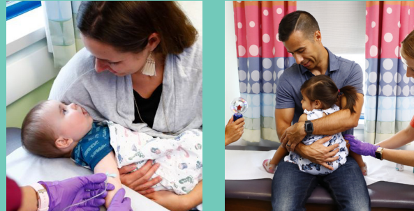
Comfort position (holding, breastfeeding, sitting or cradling)