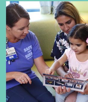
I can talk about other things that help me.