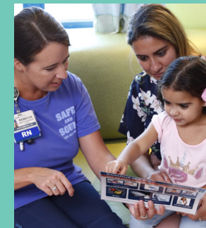
I can talk about other things that help me.