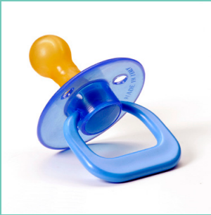
Agua azucarada (12 meses o menos)